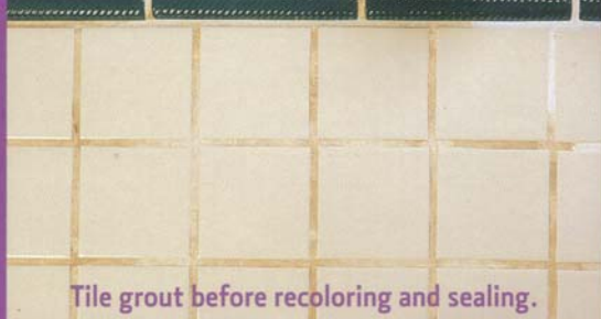
Tile grout before recoloring and sealing.